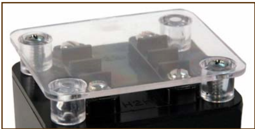
Clear Plastic Cover