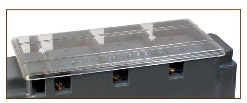
Clear Plastic Cover